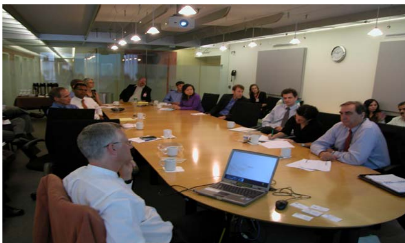
EETG Meeting June 11, 2007

The Clean Energy "Wiki" and Energy Efficiency Portal - Introduction and Discussion