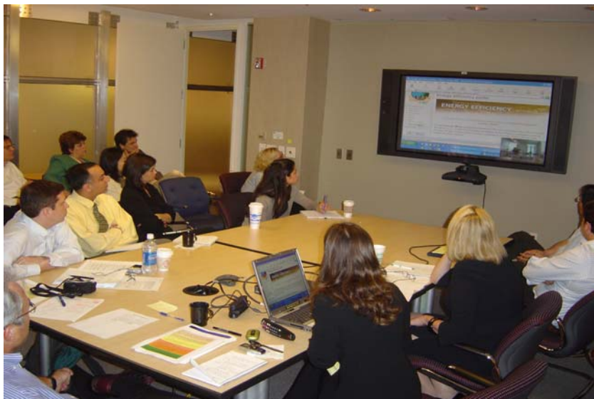
EETG Meeting and Video Conference July 12, 2007

The Clean Energy "Wiki" and Energy Efficiency Portal - Introduction and Discussion