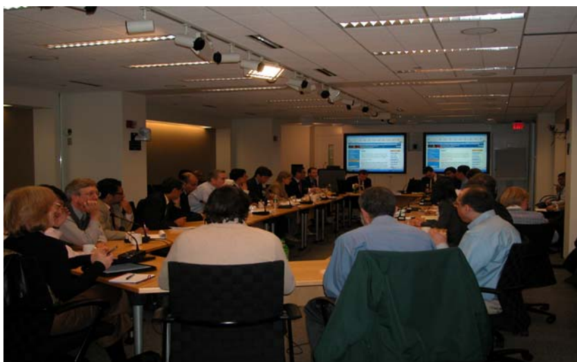
EETG Meeting, March 21, 2007

Building Energy Efficiency Codes and Carbon Finance, Opportunities Ahead