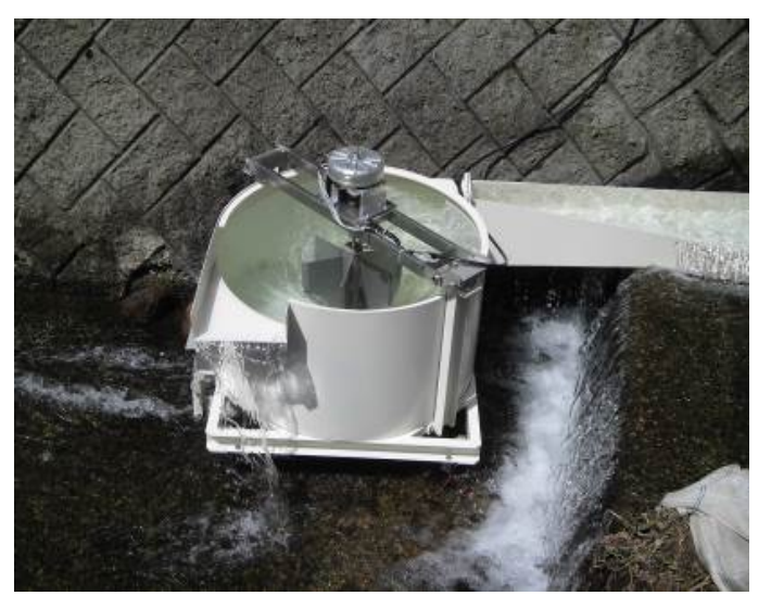
Micro Hydro 1kW ~ 15kW installed in Japan

Micro Hydro 5kW ~ 50kW installed in Japan